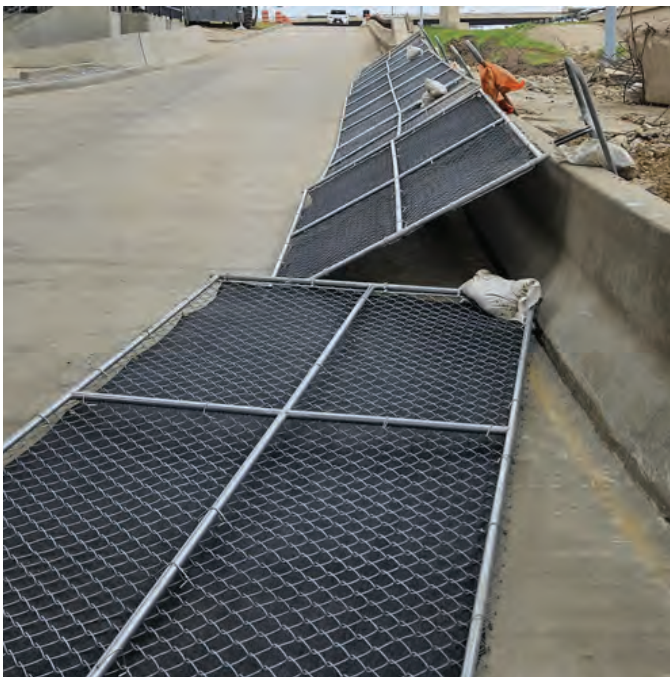
Construction fence blown over cross under #3 between A and B/ business center. South bound service road.

Using the ELERTS system, airports can promptly address construction-related concerns, mitigate risks, and improve the experience for both passengers and staff during periods of construction activity.