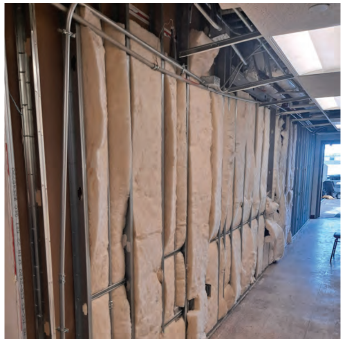
Construction crew left all the insulation exposed. This work must have occurred overnight, as it was not like this yesterday. Hallway under A48, ramp level. This hallway is high traffic, as it's Delta's only access to the south side of the ramp.