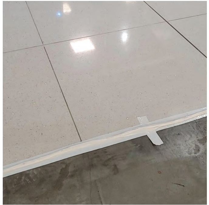
An extension cord is going across the tile by the construction at carousel 1. Two of us almost fell this morning rolling bags into our office. This is a safety issue and cannot stay this way.