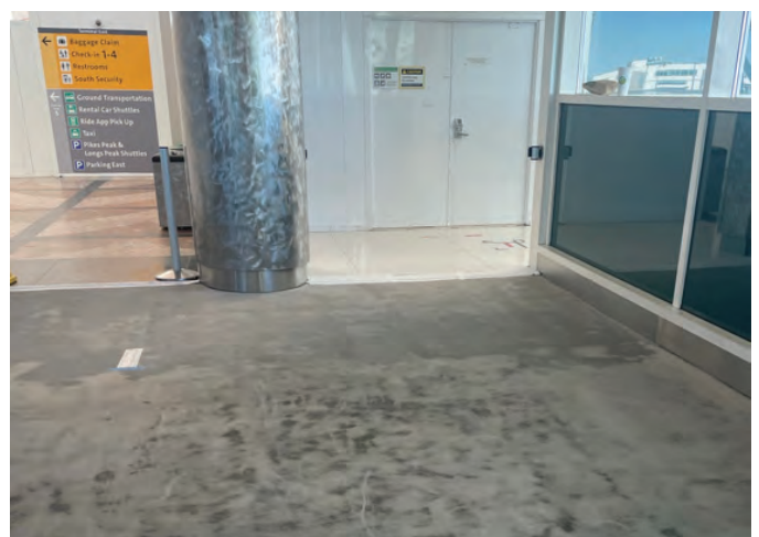
The floor is slippery on level 6 going from North terminal to the main terminal due to the construction .