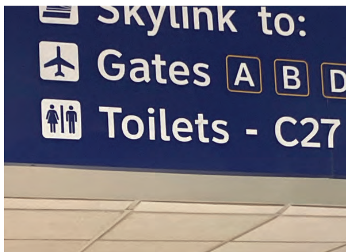
Signage incorrect near c26. Toilets at c27 are permanently closed due to construction.