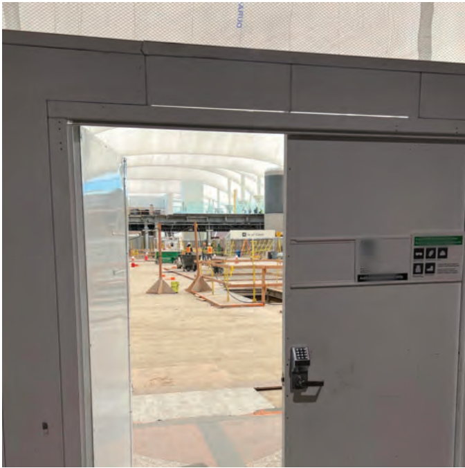
Construction area door has been left open.