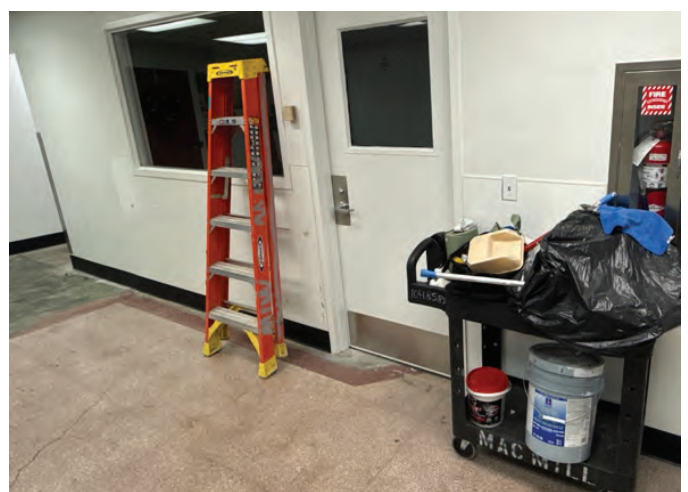
We have seen the cart for over a month and now a ladder joining the party. The construction crews cannot leave these items unattended. Safety violations for a ladder to be like this.