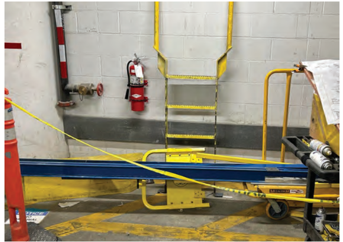
North basement egress path/ extinguisher is being obstructed due to construction materials and debris.