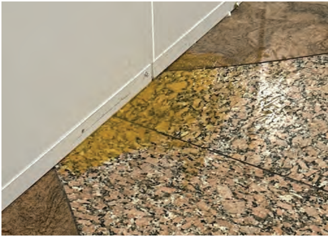
There is yellow liquid coming out from the construction area out to where people stand to wait for international arrivals.