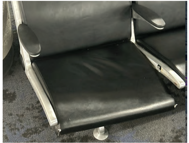
Seat broken at Gate B19.