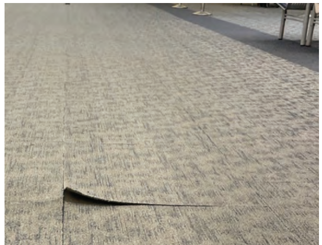
I just tripped and fell on these rotten floor tiles. In middle of terminal B.!