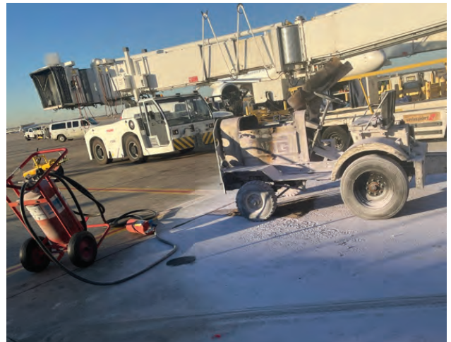
The dust of the Fire Extinguisher is a Hazard to Aircraft Engines and need to be cleaned as the wind is blowing it everywhere.