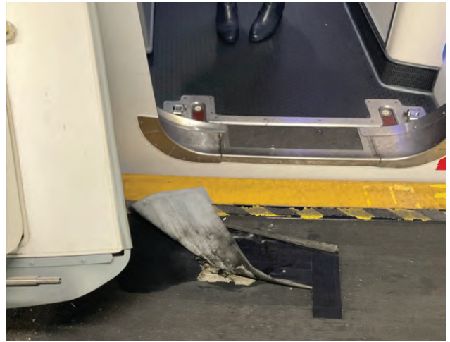
Jetbridge c17 trip hazard.