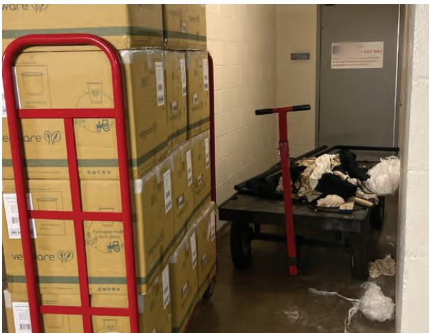
This cart with trash (cart has flat tires) is blocking an emergency fire exit.