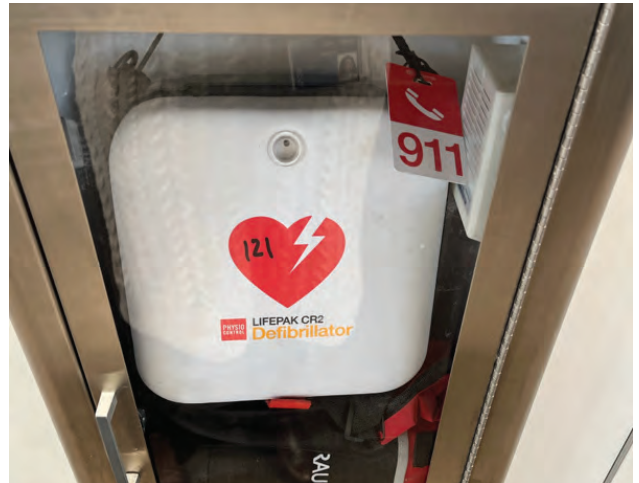
Defibrillator is beeping and blinking red. Gate A19.