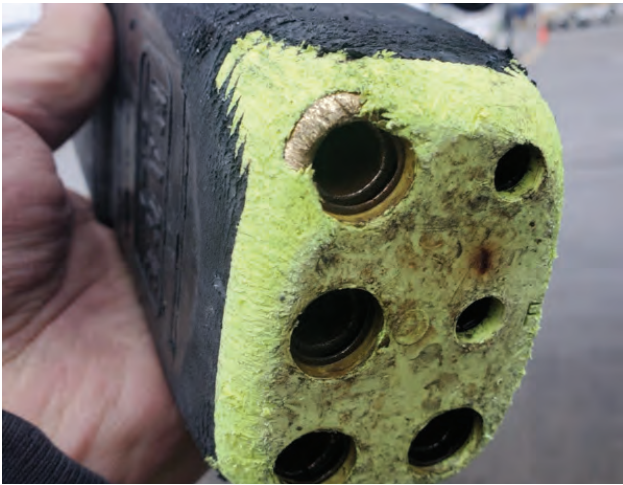
GPU head showing exposed metal. Please replace or lockout/tag ASAP.