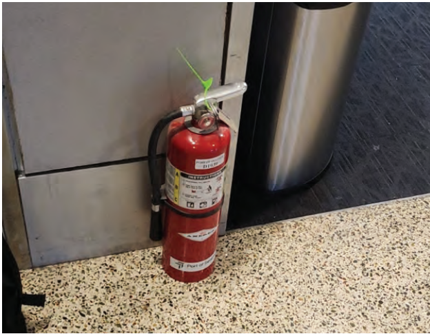
Fire Extinguisher upon floor. Not OSHA Compliant 8" off of ground.