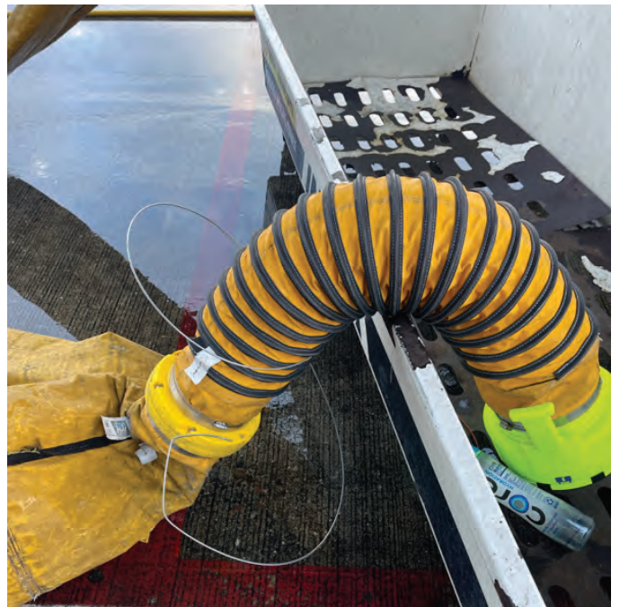
This PCA wire almost poked my eyes! Please need to fix ASAP thanks.