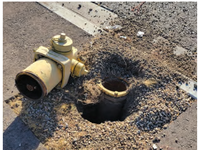
Fire hydrant broken and knocked over. Also, left a hole that should be filled or covered to avoid any fall injuries.