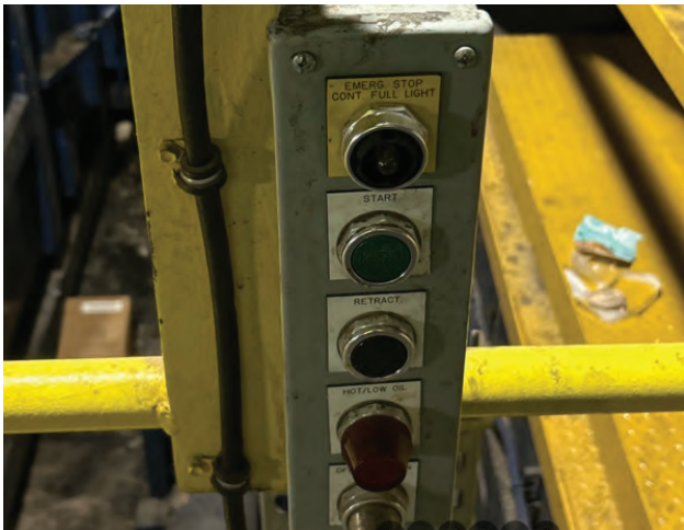
Control panel for recycle compactor at T1 concourse on the ramp level, emergency stop button is missing.