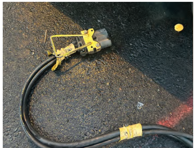
There are a lot of cords that lay on the ground or are covered in water due to employees who are in a rush not stowing them correctly.