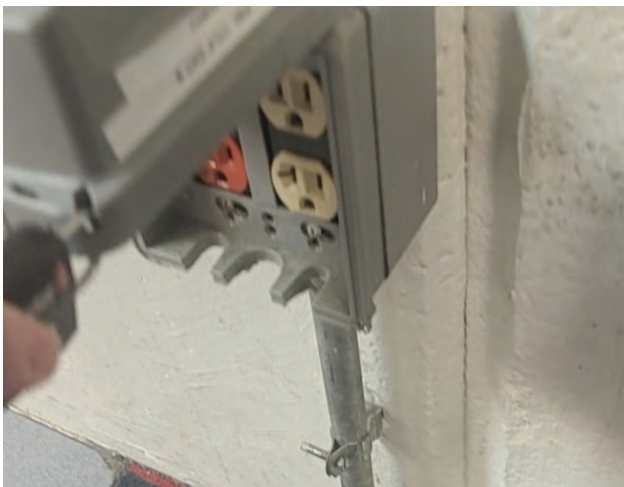
Lock box over outlet broken, c terminal gate C4, child just tried to put fingers in outlet.