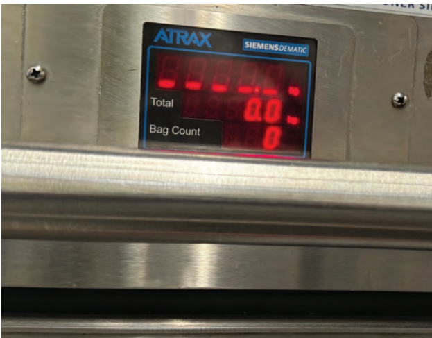
Terminal B counter number NNN are not calibrated properly, the scales are showing less 6 kg/ 10kg from the actual weight. It's a big safety concern for the weight and balance.