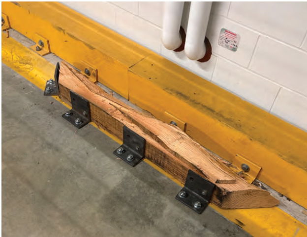
This barrier was struck and more than half of it has been sheared off. This presents a safety hazard.